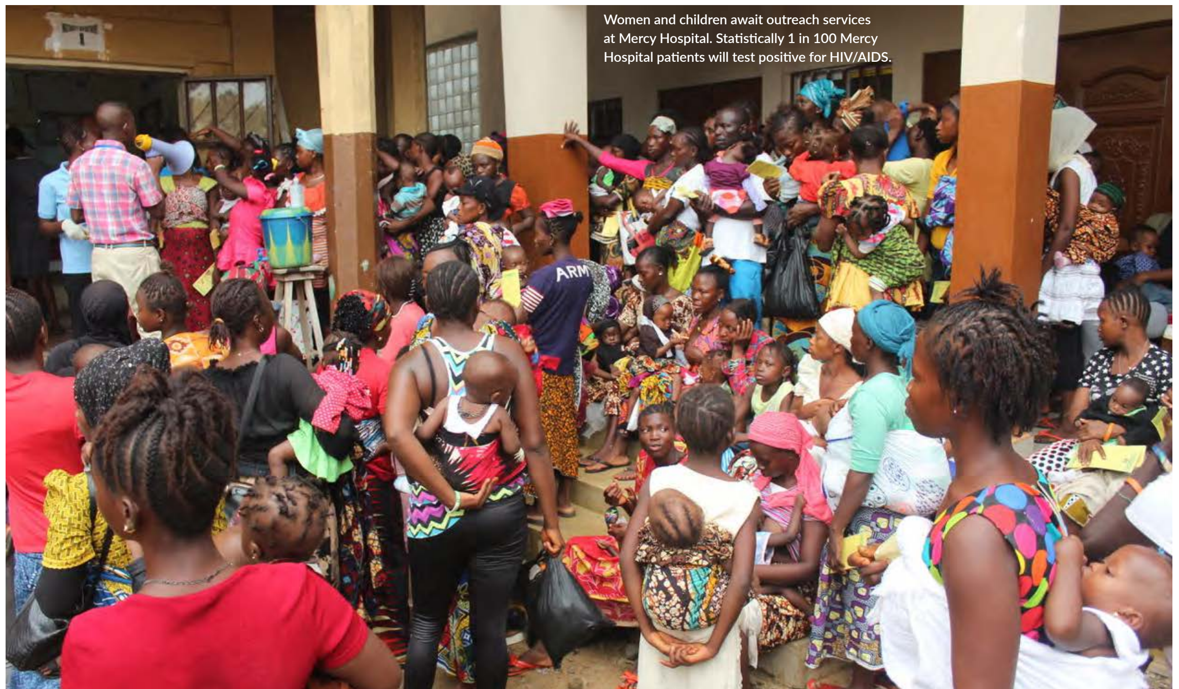
Women and children await outreach services at Mercy Hospital. Statistically 1 in 100 Mercy Hospital patients will test positive for HIV/AIDS.