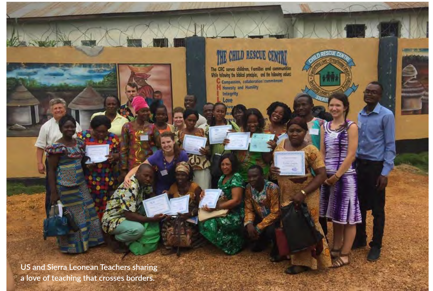
US and Sierra Leonean Teachers sharing a love of teaching that crosses borders.