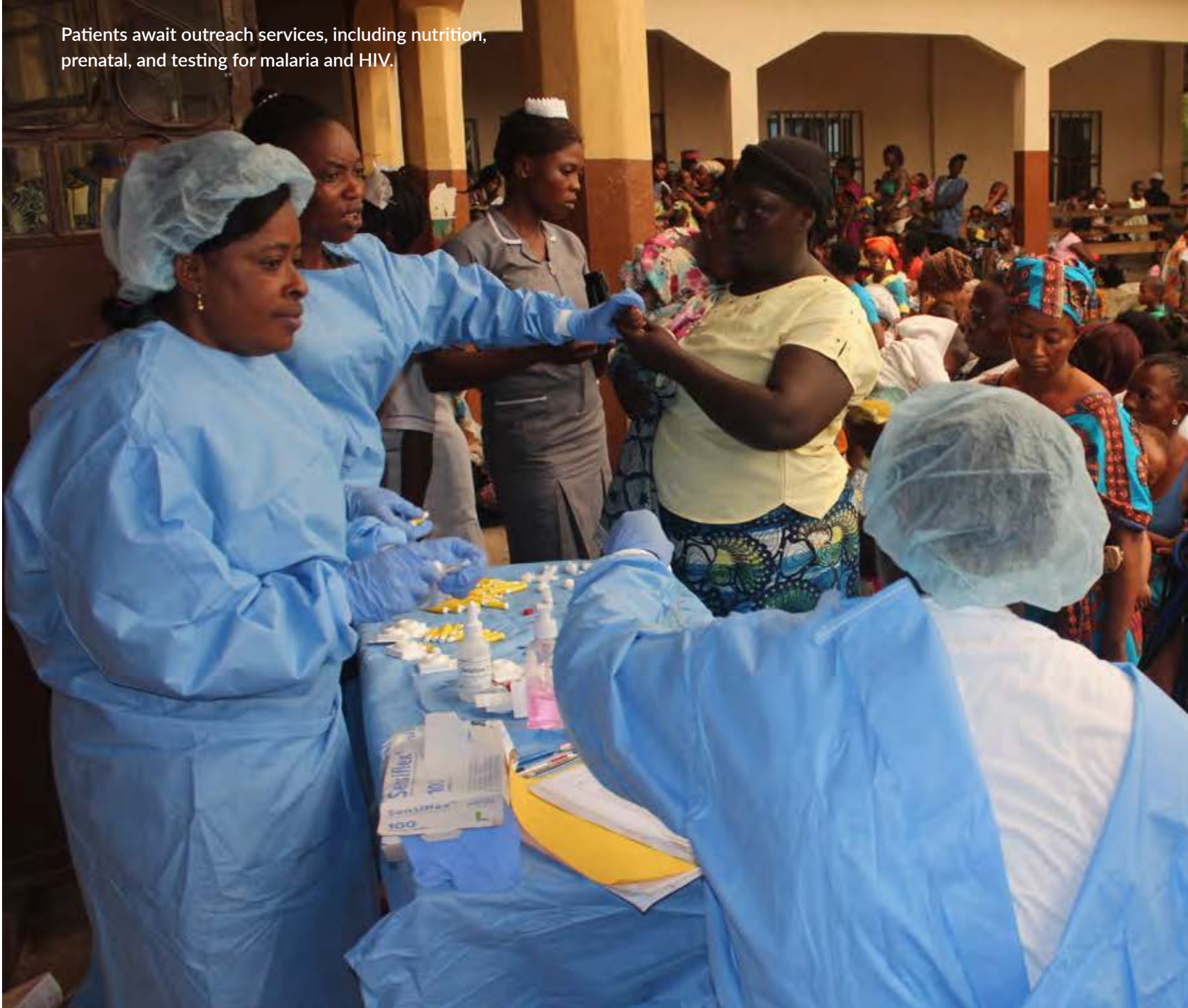
Patients await outreach services, including nutrition, prenatal, and testing for malaria and HIV.