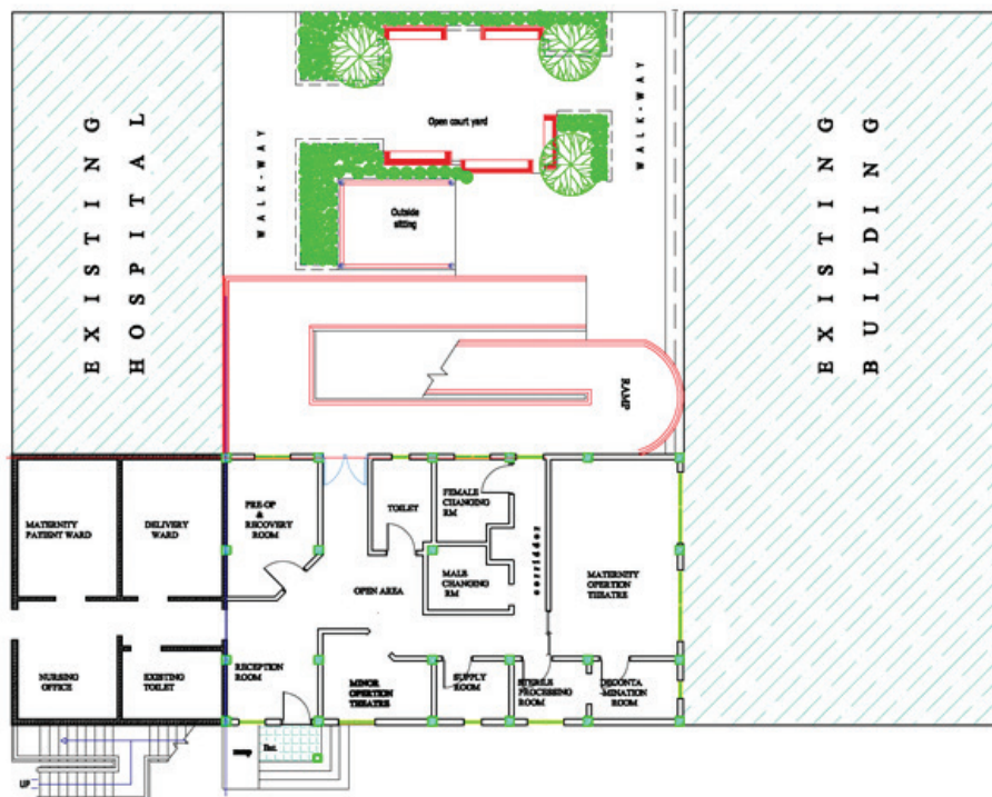
Mercy Hospital Proposed Operating Theatre Floor Plan

Last year, Mercy Hospital broke ground on a new wing. The first floor will hold two separate operating theaters, recovery room, waiting area, and office space. The second floor will house two new wards, a private ward, a conference room and exam rooms. The new wing will enable the hospital to offer Cesarean deliveries and other life-saving surgeries.